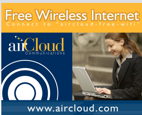
Window decals and signage for your business